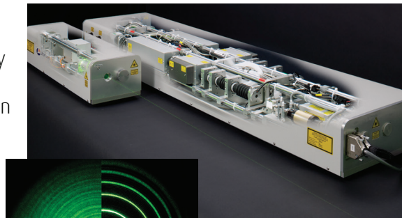
Custom dual cavity TEM 00 laser system for ESPI or holographic PIV.

The author likes to think of the phase fronts in a laser beam as pieces of very thin paper propagating one wavelength apart. In a multiple transverse (and thus multiple longitudinal mode) laser, there are large numbers of little pieces of paper propagating with no particular phase relationship. In an unstable single longitudinal mode laser, we can consider single sheets across the beam but they are badly crumpled by diffraction and thus there is no particular phase relationship from one side of the beam to the other. In a true TEM 00 system, the sheets are uniform across the beam and almost perfectly smooth, thus maintaining a constant phase relationship across the beam.